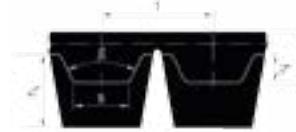
Profiles: AT5K6, AT10K6, AT10K13